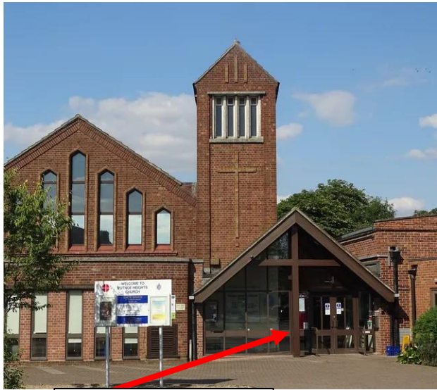
Main Door Entrance

Access will always be through the main doors to the Church from Putnoe Heights as shown below. Egress will be through the wooden side gate to the left of the main entrance.