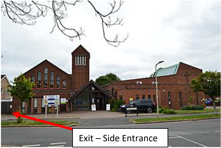
Exit – Side Entrance